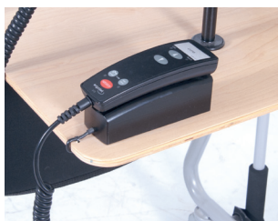
On board charging unit built in.