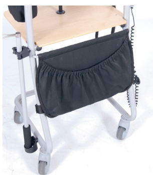
Handy pocket for storage purposes.