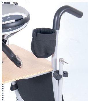
Pouch for the Luna strap and hook attachment.